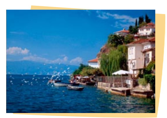
Former Yugoslav Republic of Macedonia

IPA will provide a total of €11,468 million at current prices over 2007-2013, with precise allocations decided year by year.