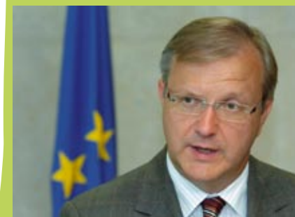
Olli Rehn Member of the European Commission responsible for enlargement

D uring half a century, the European Union has pursued ever-deeper integration while taking in new members. Most of the time the two processes took place in parallel. As a consequence, today's EU with 27 Member States and a population of close to 500 million people is much safer, more prosperous, stronger and more influential than the original European Economic Community of 50 years ago, with its 6 members and population of less than 200 million.