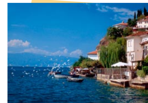
Former Yugoslav Republic of Macedonia

IPA will provide a total of €11,468 million at current prices over 2007–2013, with precise allocations decided year by year.